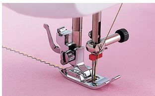
TWIN NEEDLE SEWING