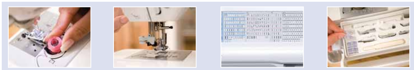
Just drop in a full bobbin and you are ready to sew.